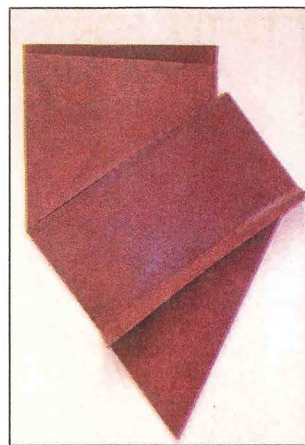
"Arrow," a found-steel construction by Merrill Wagner on display at Larry Becker Contemporary Art.

At the opposite end of the red spectrum are Wagner's commanding Arrow (2012), a geometric wall construction of found steel painted with a dark reddish brown-colored rust-preventive paint, and Steve Riedell's Folded-Over Painting (Red) (#2) (2011),